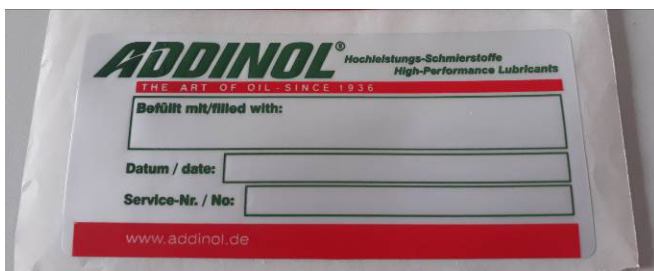
machine sticker, free lettered, protective foil included, 90x40mm, article-no: ETADDINOLM1