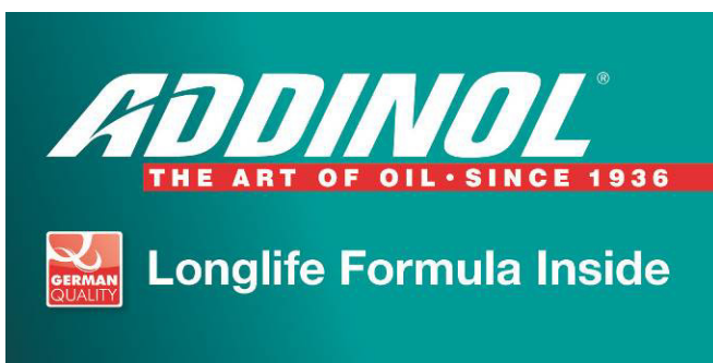
machine sticker, 200x100mm, article-no: ETADDINOLM4