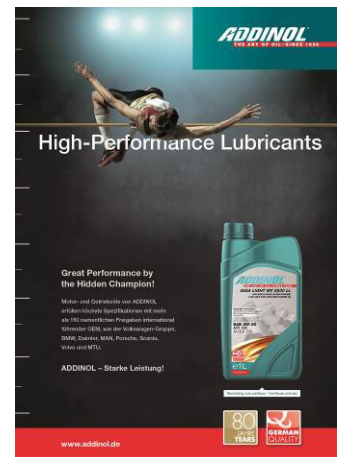
ad motif „sprinter“ and „pole vaulter“