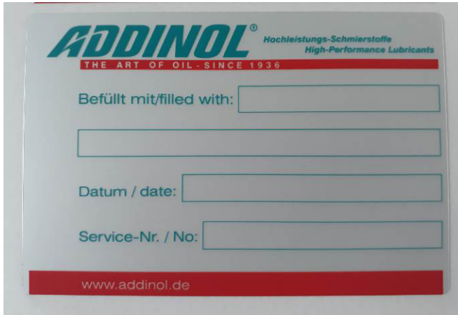
machine sticker, free lettered, protective foil included, 120x80mm, article-no: ETADDINOLM2

The following machine stickers are pre-produced and can be ordered as promotional items.