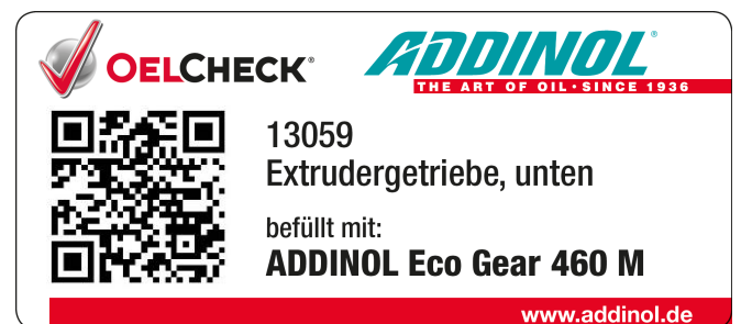
machine sticker with QR-code, 90x40mm

Further ideas of tailor made machine stickers: