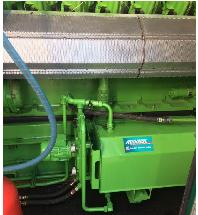
customer example: GE Jenbacher gas engine

Further ideas of tailor made machine stickers: