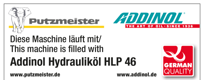
machine sticker, 100x40mm